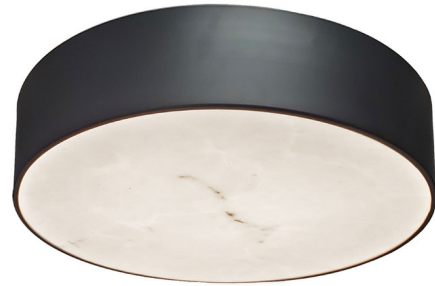
Shown in matte black / alabaster

Illuminate your home with the Walsh LED Flush Mount, a perfect blend of contemporary light design and innovative technology. This elegant piece features a beautiful faux alabaster diffuser, adding a touch of sophistication to any living or bedroom space. The integrated LED provides dimmable lighting, allowing you to create the perfect ambiance for any occasion.