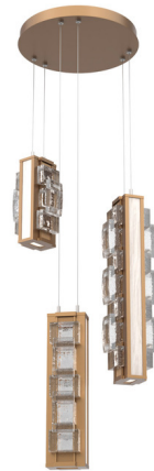
Shown in novel brass / light oak / tessera tetro cast glass

PRODUCT DIMENSIONS . . . . . Min/Max Adjustable Overall Height: 28.2"- 120" COLOR RENDERING . . . . . 93 CRI LAMP COLOR . . . . . 3000K LUMENS/WATT . . . . . 336.67 LUMINOUS FLUX . . . . . 6969 lumens