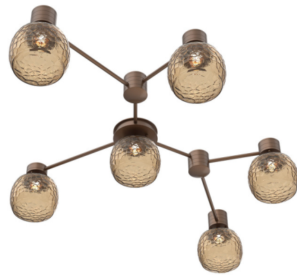
Shown in burnished bronze / vessel bronze

The Vessel Hub & Spoke Linear Ceiling Flush / Wall Sconce brings a clean fusion of a geometric form and organic design to your interior space. The smooth lineal frame holds decorative glass diffusers and casts a captivating play of light shadows across your room. Overall width is adjustable from 37 inches to 49.3 inches. Overall depth is adjustable from 22.2 inches to 41.4 inches. May be used on the ceiling or wall.