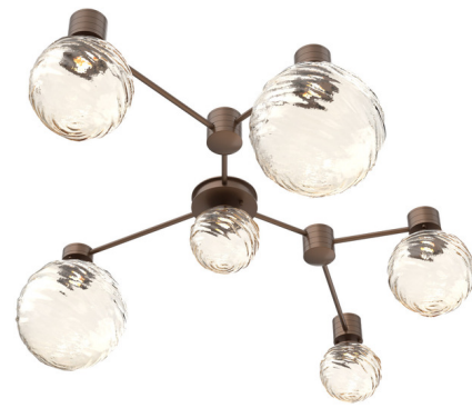
Shown in burnished bronze / amber

The Gaia Hub & Spoke Linear Ceiling Light brings a modern, organic look to your interior space. The smooth frame holds beautifully contoured orbs of hand blown, lead-free Crystal that casts warm shadows of light across your room. Overall width is adjustable from 40.4 inches to 52.7 inches. Overall depth is adjustable from 22.2 inches to 41.4 inches. Note: White shade is only available in 3000K color temperature.