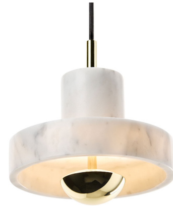
Shown in brass / white marble

LAMP LIFE . . . . . 50000 hours COLOR RENDERING . . . . . 90 CRI LAMP COLOR . . . . . 3000K LUMENS/WATT . . . . . 88.89 LUMINOUS FLUX . . . . . 800 lumens