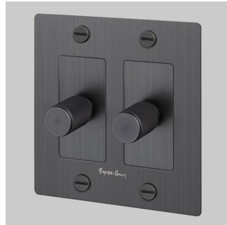
Shown in smoked bronze

The Buster + Punch Complete 2-Gang Dimmer Switch is made from stainless steel with a diamond-cut cross knurl pattern or linear knurl pattern knob. Dims halogen / incandescent (10-600 watt), and most LED (5-150 watt) loads compatible with Forward Phase / Leading Edge dimmers. The cross knurl pattern switch is finished with a flat plate and solid metal coin screws, and the linear knurl pattern switch is finished with a flat plate and six pointed Torx screws. The Complete Dimmer includes two push On/Off rotary dimmer modules compatible with 3-way switching, wall plate, and detail kit.