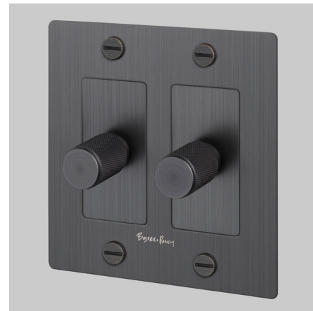
Shown in smoked bronze

The Buster + Punch Complete 2-Gang Dimmer Switch is made from stainless steel with a diamond-cut cross knurl pattern or linear knurl pattern knob. Dims halogen / incandescent (10-600 watt), and most LED (5-150 watt) loads compatible with Forward Phase / Leading Edge dimmers. The cross knurl pattern switch is finished with a flat plate and solid metal coin screws, and the linear knurl pattern switch is finished with a flat plate and six pointed Torx screws. The Complete Dimmer includes two push On/Off rotary dimmer modules compatible with 3-way switching, wall plate, and detail kit.