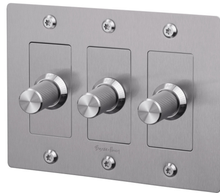
Shown in steel

The Buster + Punch Complete 3-Gang Linear Knob Dimmer Switch is made from stainless steel with a linear knurl knob. Dims halogen / incandescent (10-600 watt), and most LED (5-150 watt) loads compatible with Forward Phase / Leading Edge dimmers. The switch is finished with a flat plate and six-pointed Torx screws. The Complete Dimmer includes three push On/Off rotary dimmer modules compatible with 3-way switching, wall plate, and detail kit.