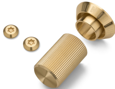
Shown in brass