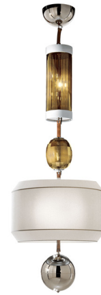
Shown in shiny nickel / teak / white

COLOR RENDERING . . . . . 80 CRI LAMP COLOR . . . . . 3000K LUMENS/WATT . . . . . 98.85 LUMINOUS FLUX . . . . . 8600 lumens