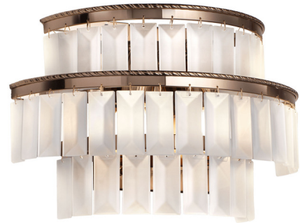
Shown in gold nickel / satin

The Charles Wall Sconce offers a glamorous, traditional look with luxe materials that will enhance the decor of any space. Charles' tiered metal frame features a decoratively detailed edge and supports an array of beveled glass rectangles that glisten like jewels.