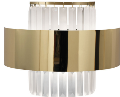
Shown in shiny gold / satin

The Crono Wall Sconce is composed of a semicircular metal frame supporting beveled satin glass ornaments that dangle beneath like jewelry. Crono's sleek, modern look and dazzling display of light and reflections make it a stunning statement piece. Includes mounting plate to cover standard 4 inch US junction box.