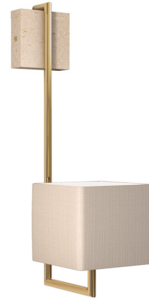
Shown in light gold / ivory

The Tinta Wall Sconce features a rectangular canopy and rectangular ivory fabric shade for a balanced, geometric look. The metal stem juts out and downwards to provide an elegant contrasting accent.