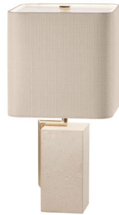
Shown in vicenza stone / ivory

The Tinta Table Lamp features a rectangular stone base and rectangular ivory fabric shade for a balanced, geometric look. The stem juts outwards and runs down the side of the lamp to provide an elegant contrasting accent.