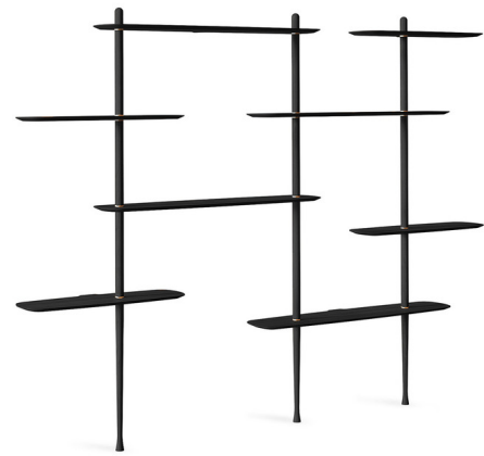
Shown in black ash / brass

The Axis 3 Shelving System is a fully customizable modular unit, supported by 3 vertical posts. These posts serve as the base, allowing for personalization of the height and arrangement of both the posts and the shelves. Set it up to fit a variety of spaces and styles.