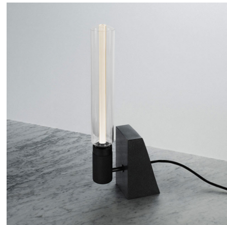
Shown in black / black marble

The Stoned Table Lamp is an innovative piece, inspired by the warmth of Victorian-era candle light. The table light hovers suspended from a single piece of solid stone in Black Marble. Inline on/off cord switch. NOTE: This is a discontinued model and limited to quantity on hand.