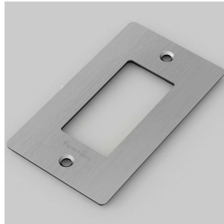
Shown in steel

The Buster + Punch Wall Plate features a clean and modern design with an industrial flair. Available in 1, 2, 3, and 4 gang wall plates in a variety of metal finishes. Each wall plate comes with inner plates and are ready to match up with Buster + Punch modules and detail kits. Mounts to standard flush mounted boxes. Note: Not all options are available. Note: Wall plates have a .16 inch shadow gap when installed. Learn more about Buster + Punch Electricity Collection here.