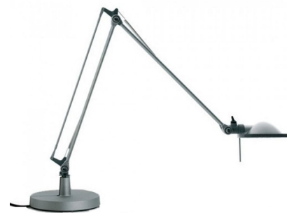
Shown in aluminum

The Berenice 17+17 Table Lamp is a light that allows for easy directional orientation in space. Reflector shown in image sold separately. Structure and base finish in Aluminum. The fluid movement of the jointed arms and the 360 degree rotation of the head make it possible to adjust the direction of the beam. Poised on a sturdy, stable base, Berenice adapts to any situation with versatility and precision. Includes 6 inch base and cord and plug with electronic transformer. On/off switch on head. UL listed. Required reflector sold separately.