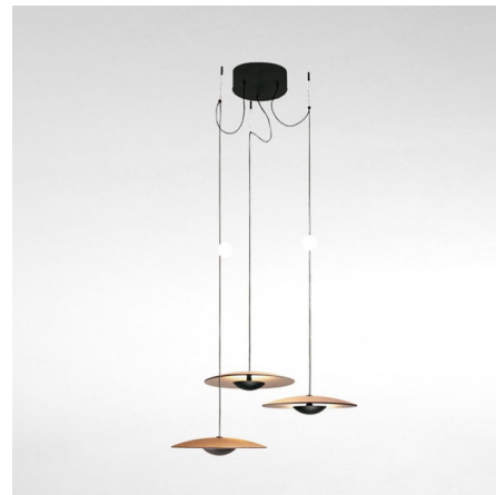
Shown in oak