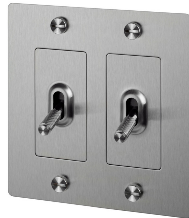
Shown in steel

The Buster + Punch On/Off Toggle Switch is a stylish and functional upgrade for your home. The sleek, minimalist design is made from solid metal, features a diamond cut, cross knurl pattern knob. The switch is finished with a flat plate and signature solid metal money penny buttons. Can be used in 3-way or single pole applications. This Complete Toggle Switch includes two 3-way toggle switches, one wall plate, and a detail kit. This switch is a 15 Amp, 120-277V AC, 60 Hz switch. Note: The 2-gang options has a 1/8 inch shadow gap when installed. Learn more about Buster + Punch Electricity Collection here .