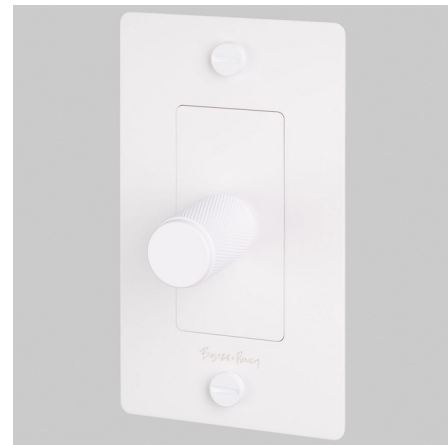
Shown in white

COLOR N/A BODY FINISH White WATTAGE 300W DIMMER N/A DIMENSIONS 2.75"W x 4.75"H BULB N/A COUNTRY OF ORIGIN China