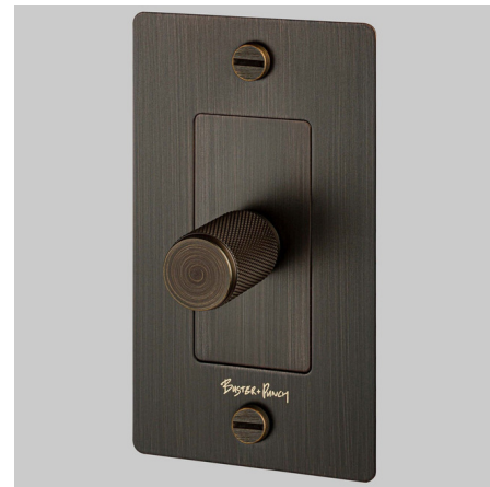
Shown in smoked bronze