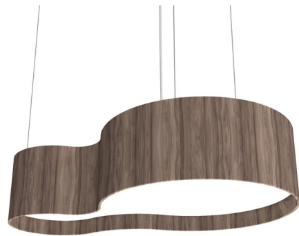
Shown in american walnut / white acrylic

PRODUCT DIMENSIONS . . . . . Adjustable Cable lengths: 120" COLOR RENDERING . . . . . 90 CRI LAMP COLOR . . . . . 3000K LUMENS/WATT . . . . . 68.75 LUMINOUS FLUX . . . . . 4400 lumens