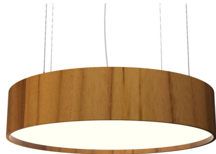
Shown in teak / white acrylic

The Cylindrical LED Pendant blends clean lines with a touch of outdoor charm, perfect for elevating your interior space. The natural veneer shade is complemented by a White Acrylic diffuser that casts soft, warm light and gentle shadows throughout your room. Note: Dimmable with Triac (standard), Low Voltage Electronic, or 0-10V Dimmers, sold separately. Cord color varies by finish and may not be as shown. Please refer to Preset Cable Options image.