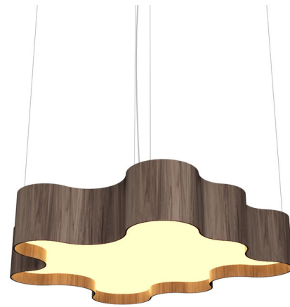
Shown in american walnut / white acrylic

The Organic Botanica Pendant blends clean lines with a touch of outdoor charm, perfect for elevating your interior space. The organic shaped natural veneer shade is complemented by a White Acrylic diffuser that casts soft, warm light and gentle shadows throughout your room. Note: Integrated LED option is dimmable with Triac (standard), Low Voltage Electronic, or 0-10V Dimmers, sold separately. Cord color varies by finish and may not be as shown. Please refer to Preset Cable Options image.