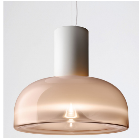
Shown in matte white / shaded pink

The Aella S Long Neck Pendant is a classic designed in 1968 by Toso and Massari. Aella, the whirlwind, embodied by the dynamic movement captured in its handblown glass diffuser; emanating from a single point, an evanescent light cone grows to create sinuous patterns and harmonic reflections. 0-10V dimming.