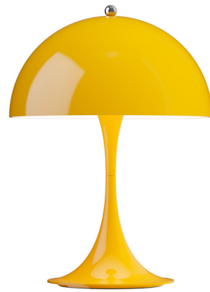
Shown in yellow