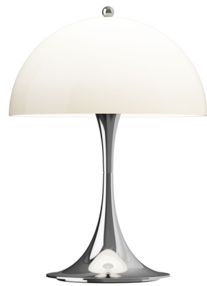
Shown in beige / chrome