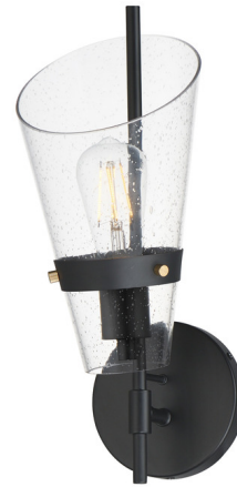
Shown in dark bronze / antique brass / clear seedy

Architectural and effortlessly striking, the Finch Wall Sconce reimagines classic forms through a modern lens. Tapered cones of clear seedy glass are precision-cut on a diagonal slant, creating dynamic lines that shift with perspective. The Dark Bronze framework is accented with subtle Antique Brass fasteners, grounding the design with a warm, tailored contrast. Finch brings visual movement and sculptural presence to transitional and contemporary spaces alike. Can be mounted up or down.