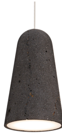
Shown in black / basalt stone