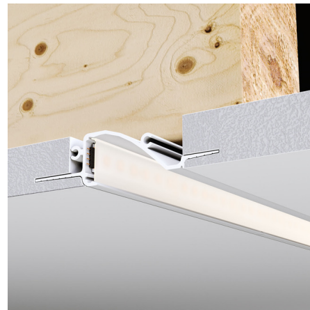
Shown in satin aluminum