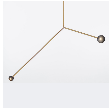
Shown in brushed brass / neutral grey textured

The Angle 1.0 Pendant offers a striking but also light and airy composition with its sleek tubular brass frame and minimalist glass globe diffusers. The angled, asymmetrical frame creates a dynamic look. Subtle variations in the weight of the handblown glass globes cause each pendant to tilt at a slightly different angle, making each pendant a one-of-a-kind object and adding understated variation when multiple pendants are installed together. Note: The overall height from the ceiling to the bottom of the fixture is specified to order and is not field adjustable. The minimum overall height is 65 inches; heights over 90 inches may be available for extra cost. Due to weight variations of the handblown glass diffusers, a +/- 4.5 inch variation in the overall height is possible. Compatible with sloped ceilings up to 30 degrees.