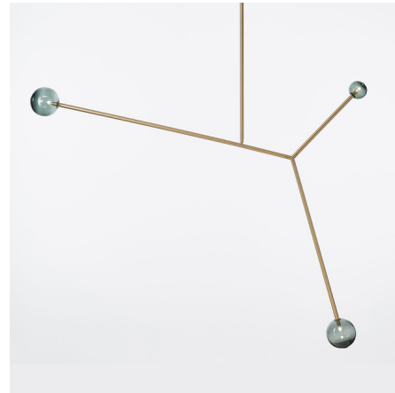
Shown in brushed brass / smoke

The Angle 2.0 Pendant offers a striking but also light and airy composition with its sleek tubular brass frame and minimalist glass globe diffusers. The angled, asymmetrical frame creates a dynamic look. Subtle variations in the weight of the handblown glass globes cause each pendant to tilt at a slightly different angle, making each pendant a one-of-a-kind object and adding understated variation when multiple pendants are installed together. Note: The overall height from the ceiling to the bottom of the fixture is specified to order and is not field adjustable. The minimum overall height is 71 inches; heights over 98 inches may be available for extra cost. Due to weight variations of the handblown glass diffusers, a +/- 4 inch variation in the overall height is possible. Compatible with sloped ceilings up to 30 degrees.