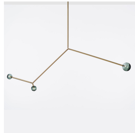
Shown in brushed brass / smoke

The Angle 3.0 Pendant offers a striking but also light and airy composition with its sleek tubular brass frame and minimalist glass globe diffusers. The angled, asymmetrical frame creates a dynamic look. Subtle variations in the weight of the handblown glass globes cause each pendant to tilt at a slightly different angle, making each pendant a one-of-a-kind object and adding understated variation when multiple pendants are installed together. Note: The overall height from the ceiling to the bottom of the fixture is specified to order and is not field adjustable. The minimum overall height is 56 inches; heights over 83 inches may be available for extra cost. Due to weight variations of the handblown glass diffusers, a +/- 2.5 inch variation in the overall height is possible. Compatible with sloped ceilings up to 30 degrees.