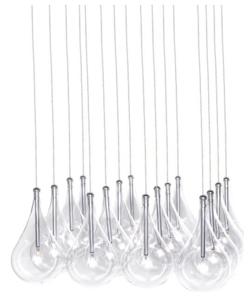
Shown in polished chrome / clear

PRODUCT DIMENSIONS . . . . . Min/Max Overall Height: 11" -122" LAMP COLOR . . . . . 2900K LUMENS/WATT . . . . . 192.00 LUMINOUS FLUX . . . . . 1920 lumens