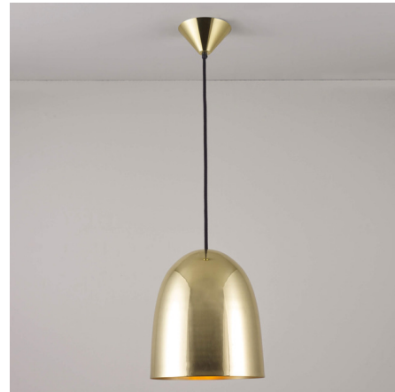
Shown in polished brass

The Stanley Pendant is hand spun in Birmingham, UK and perfect where you want an industrial vibe. The polished brass shade elevates the piece and helps direct bright task light onto surfaces below.