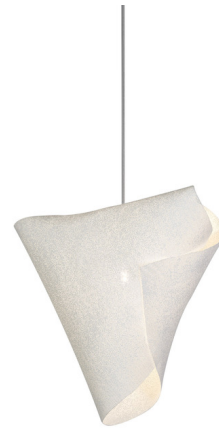
Shown in stainless steel / white

PRODUCT DIMENSIONS . . . . . Canopy: 5.6" diameter