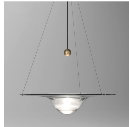
Shown in brass / crystal sandblasted

LAMP COLOR . . . . . 3000K LUMENS/WATT . . . . . 150.00 LUMINOUS FLUX . . . . . 450 lumens