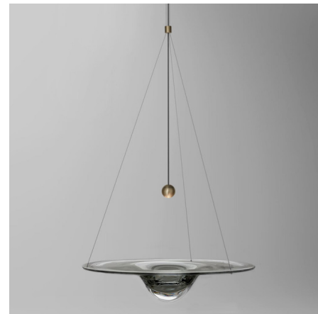
Shown in brass / grey

LAMP COLOR . . . . . 3000K LUMENS/WATT . . . . . 150.00 LUMINOUS FLUX . . . . . 450 lumens