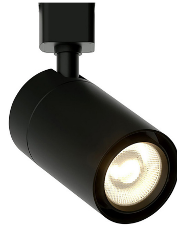
Shown in black / clear

The GX15 Track Light offers superior light output in a small, unobtrusive design. Has a 35 degree angle, 350 degree rotation and 90 degree tilt. Adaptor designed with adjustable conductor for 2 circuit (J and L Type) tracks, sold separately. Choice of J or L Track System compatibility. Compatibility:L: WAC L Series and Lightolier Lytespan 120 volt single circuit track (Lightolier track by others) J: WAC J Series single circuit track and Juno 120 volt single circuit and two circuit track systems.