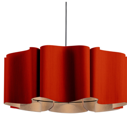
Shown in black / red / natural acoustic

PRODUCT DIMENSIONS . . . . . Adjustable Cable Length: 108"