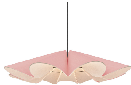
Shown in black / rose / natural acoustic

COLOR . . . . . Rose / Natural Acoustic BODY FINISH . . . . . Black WATTAGE . . . . . 17W DIMMER . . . . . Standard 120V DIMENSIONS . . . . . 39.4"W x 10.25"H BULB NOT INCLUDED . . . . . 1 x A19/Medium (E26)/17W/120V LED COUNTRY OF ORIGIN . . . . . Spain