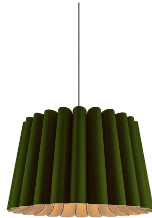
Shown in black / green / natural acoustic

The Renata Long Acoustic Pendant is a sculptural lighting piece that enhances your interior with both beauty and function. Crafted from curved wood veneer segments joined around a central frame, it casts warm, organic shadows throughout the room. The interior is lined with acoustic felt made from 80% wool and viscose biodegradable, OEKO-TEX Standard 100 certified, and ISO 9001 compliant, ensuring it's free from harmful substances while offering sound-dampening performance. Acoustical testing at a NVLAP Lab per ASTM C423 and ASTM E795 standards Bruck's WEP (Wood Ecological Project) collection specializes in sustainable, natural wood luminaires. Every made to order fixture's unique character is nothing short of art. WEPlight solutions help cultivate a serene environment in any space. Designed, handcrafted, and painted by master artisans with reconstructed real wood veneer and assembled in the USA.