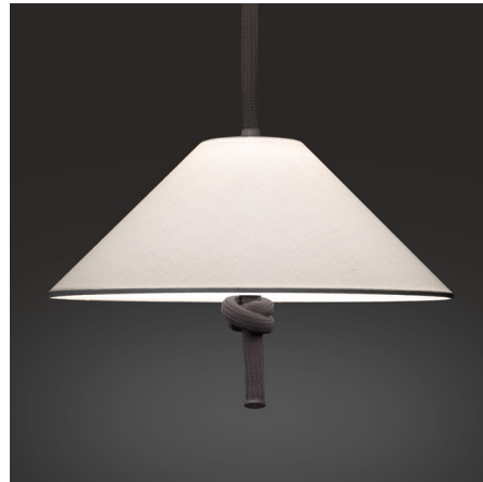
Shown in graphite grey / white linen

The Hat Pendant is a tribute to 1950s French design with an neatly tailored, essential silhouette. The shade is available in classic linen or modern Tyvek, both offering a rich texture along with the stylish rope that suspends the shade. Hat's balance of craftsmanship, materiality, and a contemporary vision make it an elegant addition to any interior.