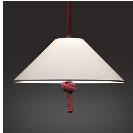
Shown in japanese red / white linen

The Hat Pendant is a tribute to 1950s French design with an neatly tailored, essential silhouette. The shade is available in classic linen or modern Tyvek, both offering a rich texture along with the stylish rope that suspends the shade. Hat's balance of craftsmanship, materiality, and a contemporary vision make it an elegant addition to any interior.