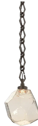
Shown in flat bronze / amber

PRODUCT DIMENSIONS . . . . . Min/Max Adjustable Overall Height: 14.3" – 69.3" COLOR RENDERING . . . . . 93 CRI LAMP COLOR . . . . . 3000K LUMENS/WATT . . . . . 70.00 LUMINOUS FLUX . . . . . 420 lumens