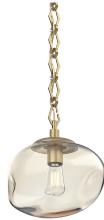
Shown in gilded brass / amber

The Nova Diamond Chain Pendant brings a simple elegance to your interior space. The handcrafted diamond link chain is complemented by an organic oval shaped artisan blown crystal glass shade that casts warm shadows of light across your room. Each Piece is a unique work of art. Sloped ceiling compatible to 45 degrees.