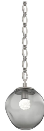
Shown in beige silver / smoke floret

PRODUCT DIMENSIONS . . . . . Min/Max Adjustable Overall Height: 16.9" – 71.9" COLOR RENDERING . . . . . 93 CRI LAMP COLOR . . . . . 3000K LUMENS/WATT . . . . . 70.00 LUMINOUS FLUX . . . . . 420 lumens