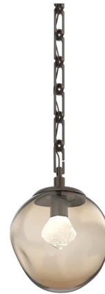
Shown in flat bronze / bronze zircon

PRODUCT DIMENSIONS . . . . . Min/Max Adjustable Overall Height: 16.9" – 71.9" COLOR RENDERING . . . . . 93 CRI LAMP COLOR . . . . . 3000K LUMENS/WATT . . . . . 70.00 LUMINOUS FLUX . . . . . 420 lumens