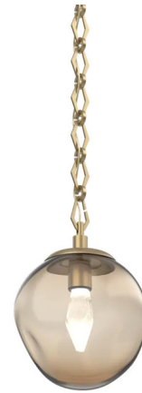
Shown in gilded brass / bronze geo

PRODUCT DIMENSIONS . . . . . Min/Max Adjustable Overall Height: 16.9" – 71.9" COLOR RENDERING . . . . . 93 CRI LAMP COLOR . . . . . 2700K LUMENS/WATT . . . . . 70.00 LUMINOUS FLUX . . . . . 420 lumens