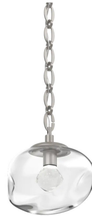
Shown in beige silver / clear zircon

PRODUCT DIMENSIONS . . . . . Min/Max Adjustable Overall Height: 14.5" - 69.5" COLOR RENDERING . . . . . 93 CRI LAMP COLOR . . . . . 3000K LUMENS/WATT . . . . . 70.00 LUMINOUS FLUX . . . . . 420 lumens